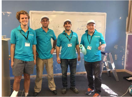
The hard working team